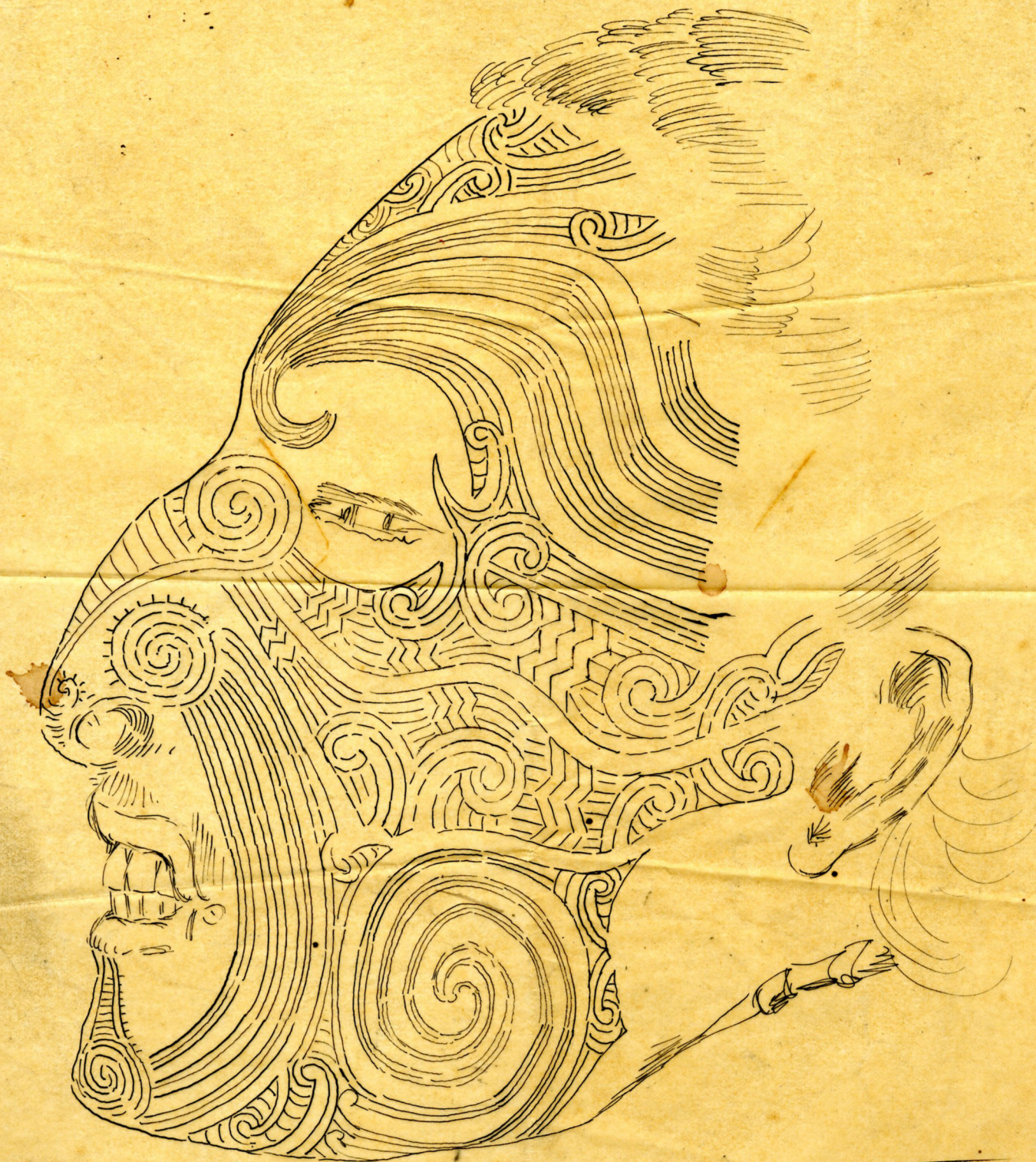
Tattooing in Bands - the right side has a scroll pattern