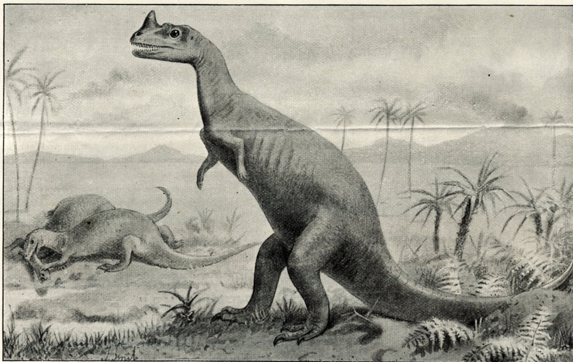
A LARGE HORNED DINOSAUR (CERATOSAURUS) FROM NORTH AMERICA. JURASSIC PERIOD.

(A Syllabus is supplied on application.)