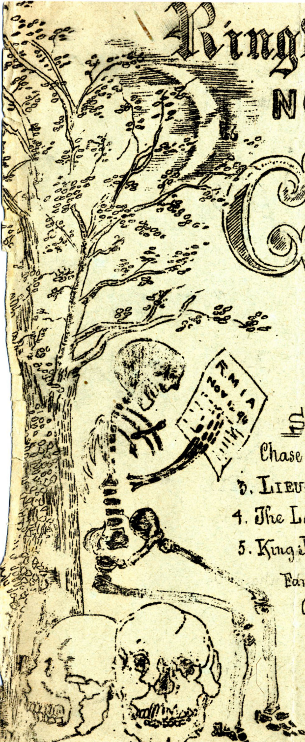
Larmer Tree. Visitors from Farnham Museum.

Ancient Pottery at Farnham. British & Roman Weapons.